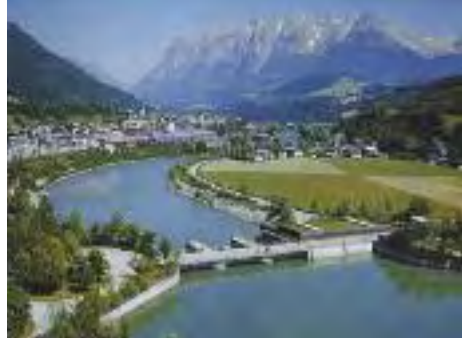
2 x 8 MW, Bischofshofen, Austria

All process signals should be received and managed without requiring multiple inputs. In order to enable efficient short and long range communication, as well as facilitate future expansion, it is essential to apply international standards here. Costs must be reduced to a minimum by using one hardware platform and thus reducing spare part inventory, and by applying integrated functions to keep maintenance and service activities to a minimum. Step-by-step expansion and integration of additional plant sections (switchyard or station service, for example) should always be an easy, straightforward task.