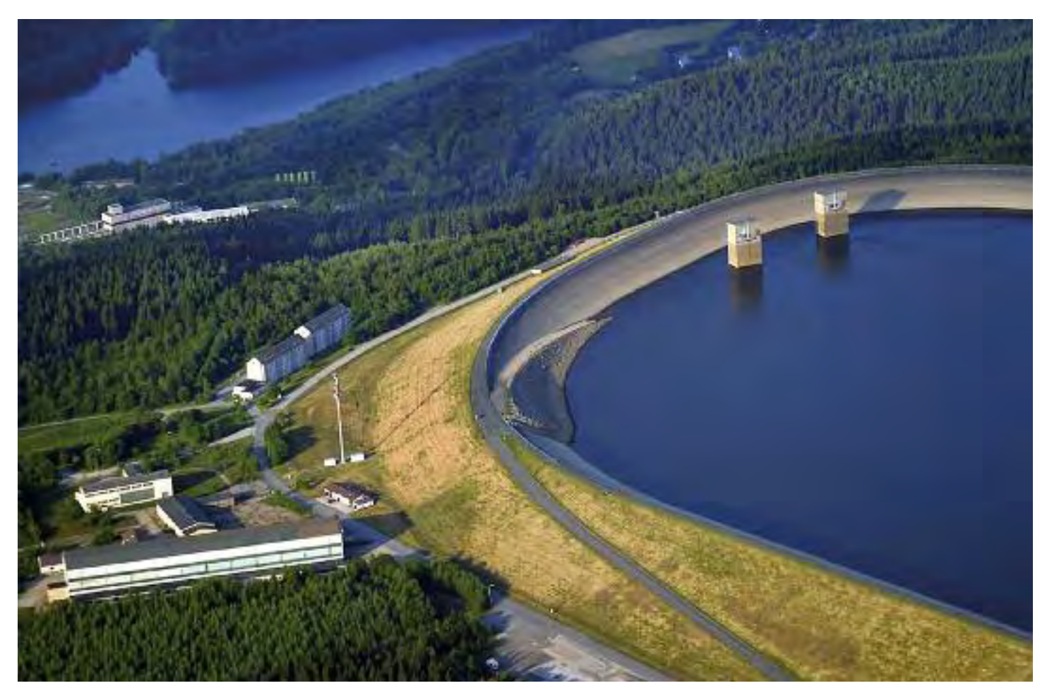
6 x 175 MW, Markersbach, Germany